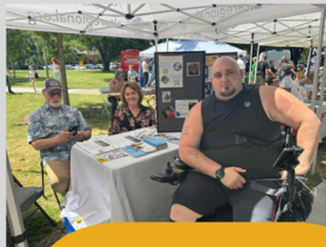
Slavic Festival Yarmarka