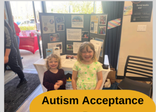
Autism Acceptance Day