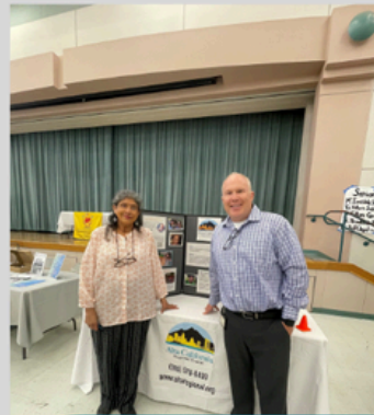
WeEmbrace Disability Resource Fair