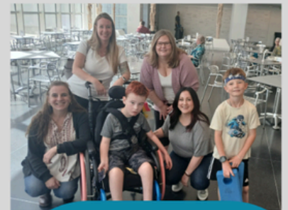
Art on the Spectrum