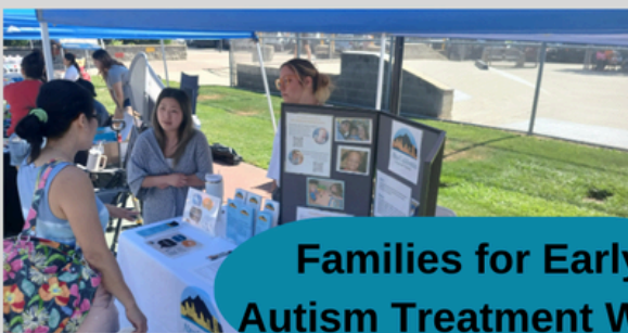
Families for Early Autism Treatment Walk