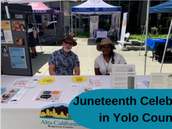
Juneteenth Celebration in Yolo County