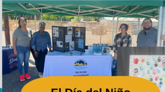
El Día del Niño