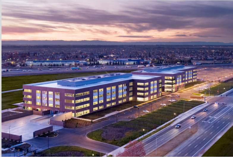
ACRC's new Sacramento office

The Quarterly Client, Service Provider, and Staff Update Newsletter