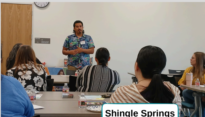
Shingle Springs Tribal TANF