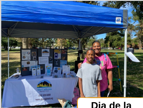
Día de la Familia