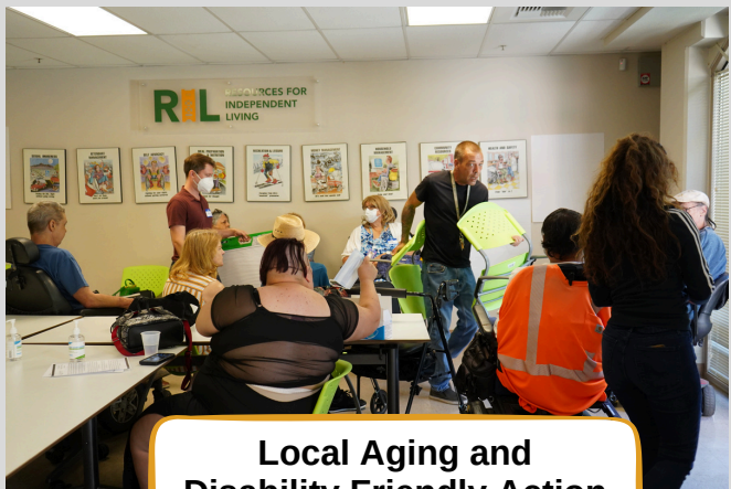
Local Aging and Disability Friendly Action Plan by Resources for Independent Living