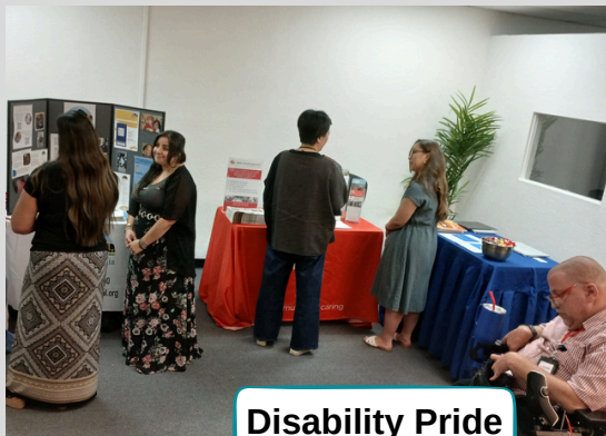
Disability Pride Resource Fair