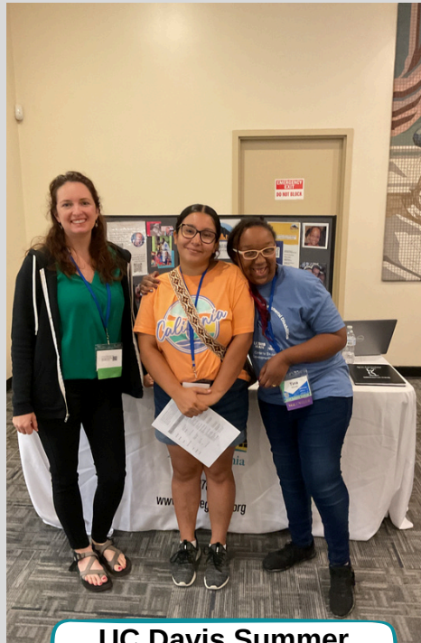
UC Davis Summer Institute on Neurodevelopmental Disabilities