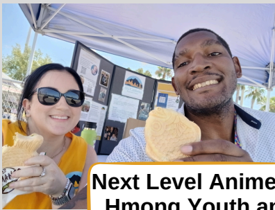
Next Level Anime by Hmong Youth and Parents United